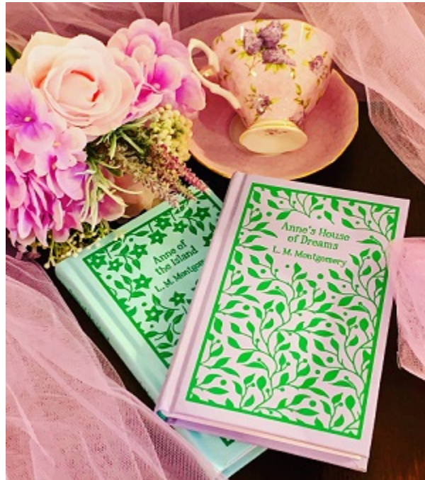
Covers of two of L.M. Montgomery's books.

A more formal, printed version of this essay is under revision for the Journal of L.M. Montgomery Studies , so you can see my Works Cited page, too. Details coming soon!