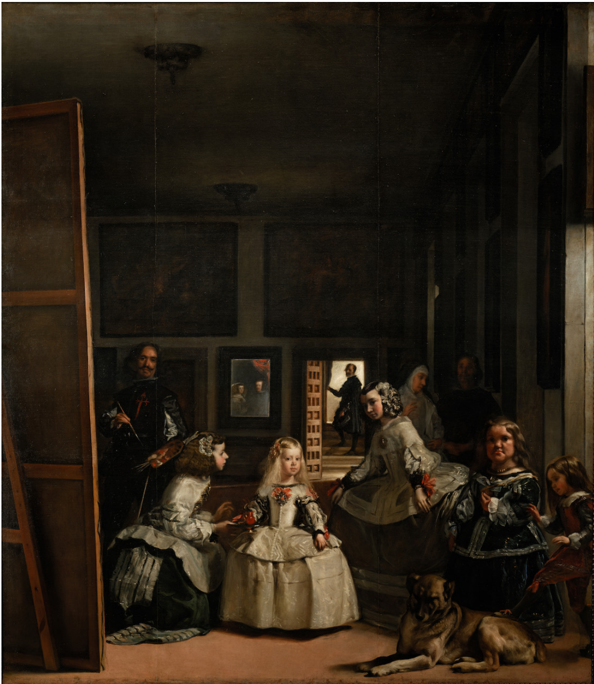
Diego Velázquez, Las Meninas (1656-1657). Prado Museum, Madrid