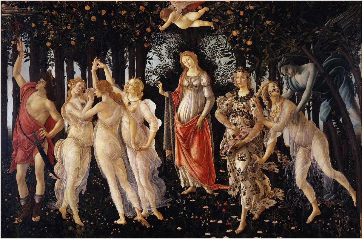
Sandro Botticelli, Primavera (1482). Uffizi, Florence, Wikipedia, https://en.wikipedia.org/wiki/Primavera_(Botticelli)#/media/File:Bottic...

As well as viewing Kilmeny from the perspective of an artist, Eric assumes two other perspectives that objectify and subject her to the male gaze. The first of these is the perspective of the experienced adult regarding a naive child. Eric's position of power from the centre of the Foucauldian panopticon is intensified because Kilmeny lacks a clear view of herself and therefore sees herself through others' eyes, as might an unformed and uninformed child. In the first scene when Eric sees her, she appears