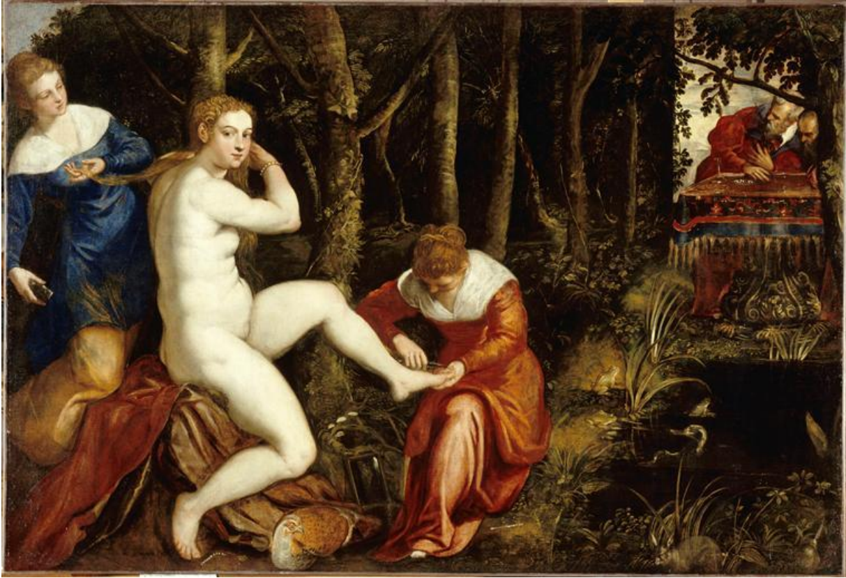
Jacopo Robusti Tintoretto, Suzanne au Bain (1550-1560). Louvre, Paris, Wikipedia, https://en.wikipedia.org/wiki/Susanna_and_the_Elders_(Tintoretto)#/medi...