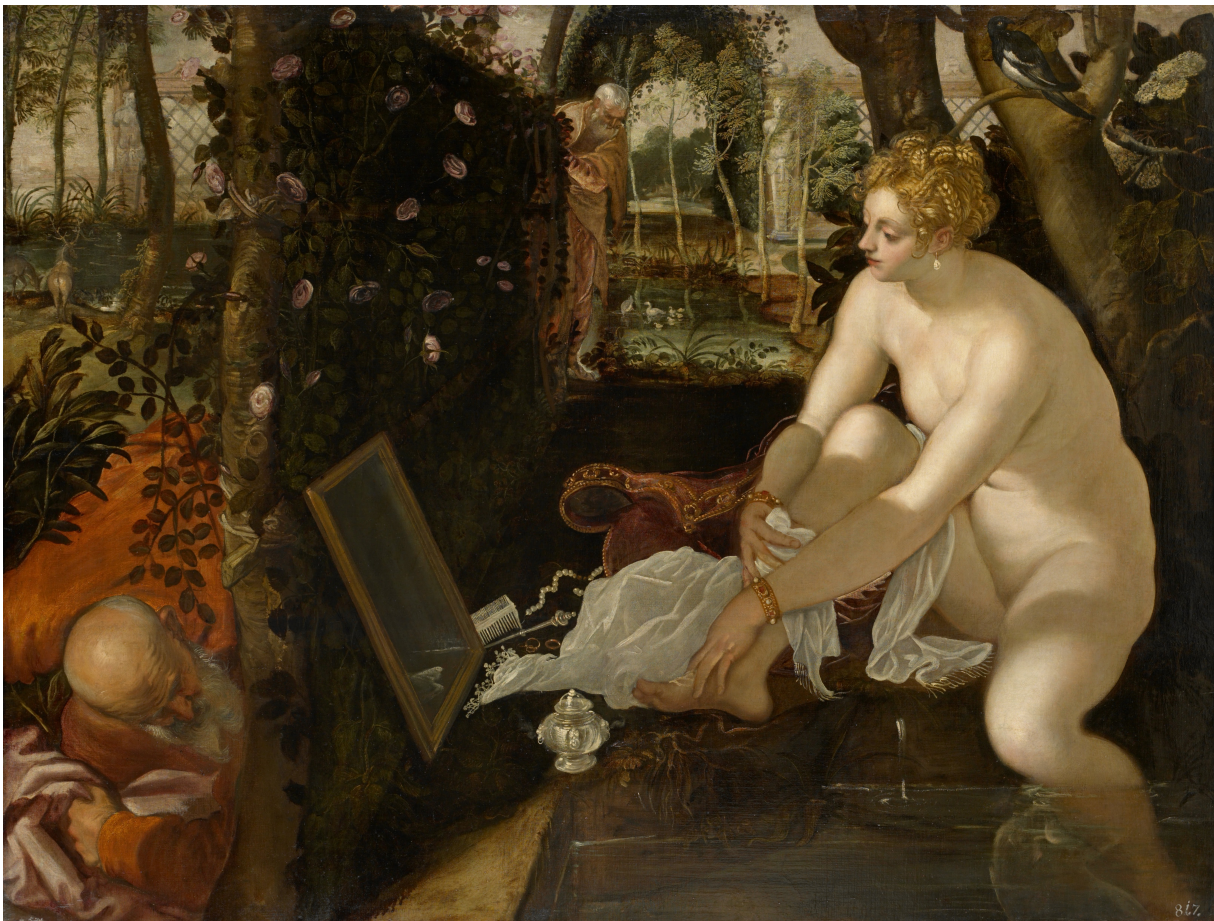
Jacopo Robusti Tintoretto, Susanna and the Elders (1555–1556).

Artworks portraying women often invite the viewer's gaze by including a spectator inside the image itself. 14 In Ways of Seeing , John Berger reflects on two different paintings by Jacopo Tintoretto, both on the biblical subject of "Susannah and the Elders," in which the elders are visible but hidden, watching Susannah bathe. At the same time, Berger points out, we the viewing audience "join the Elders to spy on Susannah." 15