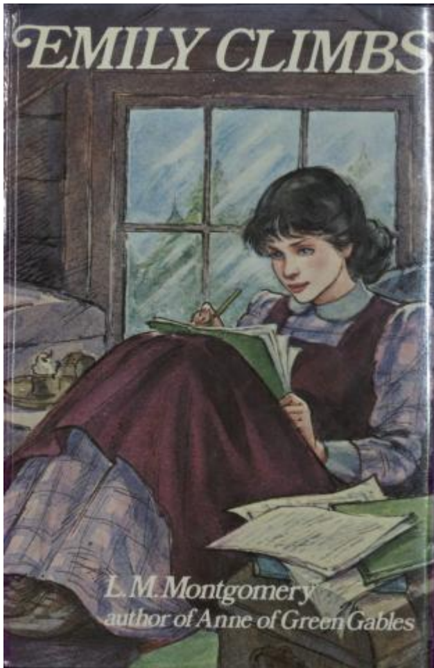
Book cover of Emily Climbs . 1981. KindredSpaces.ca , 014 EC-AR.

independently.” 5 Clearly, it is widely accepted that the Emily books form a type of Kunstlerroman , the development of the writer and the particular challenges she faces occupying a significant portion of the novels.