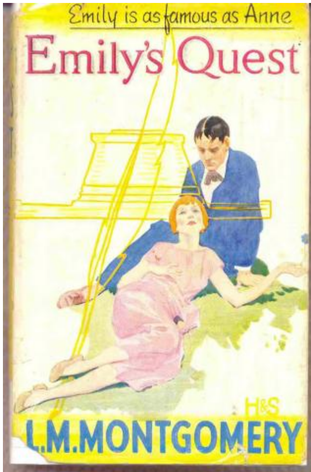
Book cover of Emily's Quest. 1930.

wedding in the handwriting of a family member, seeing a tintype representing the couple, reading a newspaper clipping containing an account of the wedding with a description of the bride's dress, and handling a piece of the dress described in the newspaper account and represented in the tintype. The act of reading is not limited to the text of the Bible and includes tactile elements such as Emily records in her encounters with the New Moon books. Indeed, it is not clear that this particular Bible has ever been read for its text. Emily's account of her experience with Aunt Nancy's Bible details her awareness, even at this early age, of books having a function or value outside of or beyond their designed function.