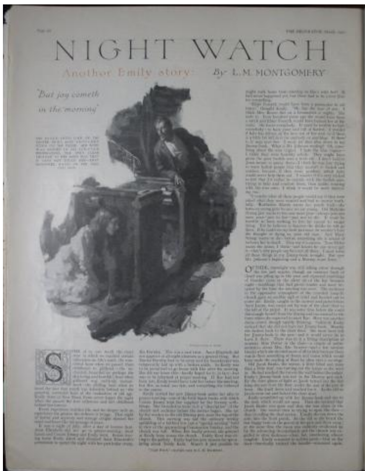
Periodical cover of Delineator . March 1925. KindredSpaces.ca , P088 D 1925.03 S.

able to give her an accurate assessment of the public value of her work. His encouragement is one of the factors in Emily's dedicating herself professionally, even though some of what he reads (her sketch of himself, for instance) was not intended for an audience. Emily understands that education drives her literary judgment and is essential to her career preparation, so when she believes Aunt Elizabeth will not allow her to go to high school in Shrewsbury she plans to "work and study at New Moon," thinking that "another year with Mr. Carpenter would do a great deal for her" on her Alpine Path. 58 Her desire for education echoes the feeling Montgomery expressed when she was planning to attend Dalhousie University: "I am anxious to spend a year at a real college as I think it would help me along in my ambition to be a writer." 59