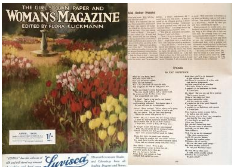
Photo of The Girl's Own Paper and Woman's Magazine , edited by Flora Klickmann, vol. 47, no. 7, April 1926.