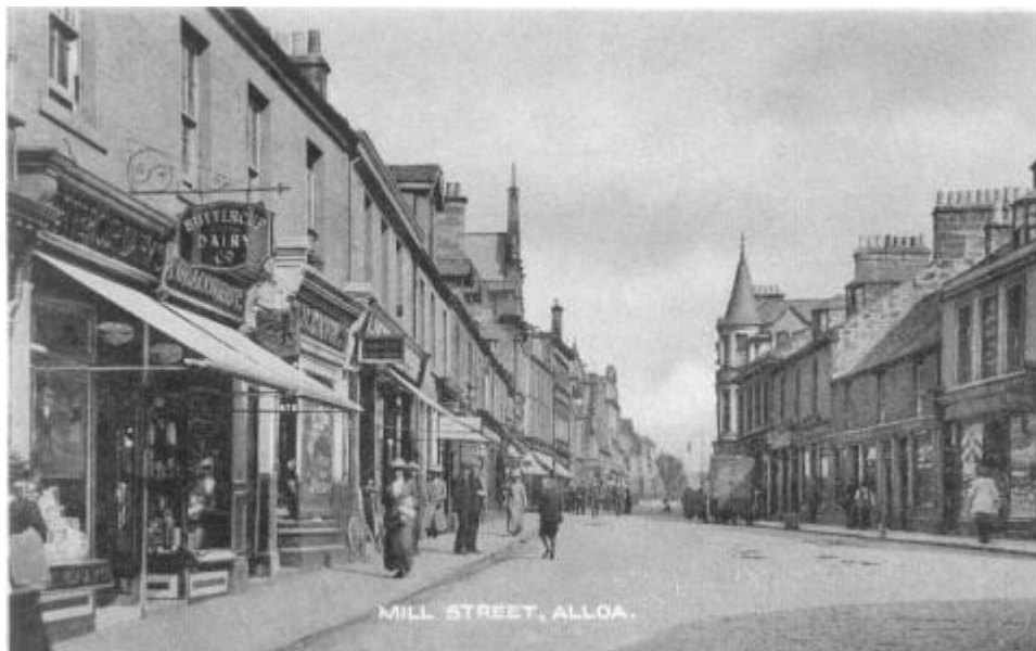
"Mill Street, Alloa Photographs." GENUKI, UK and Ireland Genealogy. genuki.org.uk/big/sct/CLK/Alloa/AlloaPics .