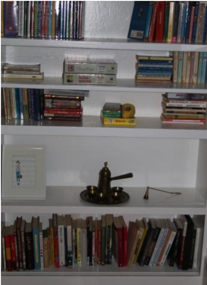
Author's bookshelf. 2020.

public library, I read some e-books but wanted to read something I could hold in my hand. So, I turned to my own bookshelves. They are full of works of contemporary literary and cultural theory, Mexican history and literary criticism, and other books I've reviewed for journals. There is also a section of Canadian literature—classics such as L.M. Montgomery's Anne of Green Gables and more recent works such as Dionne Brand's 2019 novel Theory .