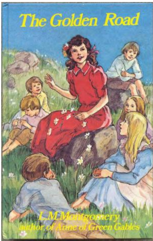
Book cover of The Golden Road . 1982. KindredSpaces.ca , 010 GR-AR.

Anne is a reader. Indeed, this exchange with Aunt Jimsie happens while Anne is away at university, reading and studying much of the time. We know Anne is a longstanding reader because as a child she often cites things she “read in a book,” and we hear about Anne being punished for reading Ben Hur during class, a book that was lent to her by Jane Andrews, alongside another book lent to her by Ruby Gillis. 2 The all-too-often-overlooked Diana is first described when she meets Anne as “sitting on the sofa, reading a book,” and Diana’s mother subsequently comments that “she reads entirely too much” and is “always poring over a book.” 3 Outside the Anne series, Valancy’s devotion to nature books changes the entire course of her life, and we are told that she “enjoyed” them, even though “a book that was enjoyable was dangerous.” 4 Emily is a reader, all the girls at Patty’s Place are readers, and though Sara Stanley is not a reader per se, her life is surrounded by stories and storytelling.