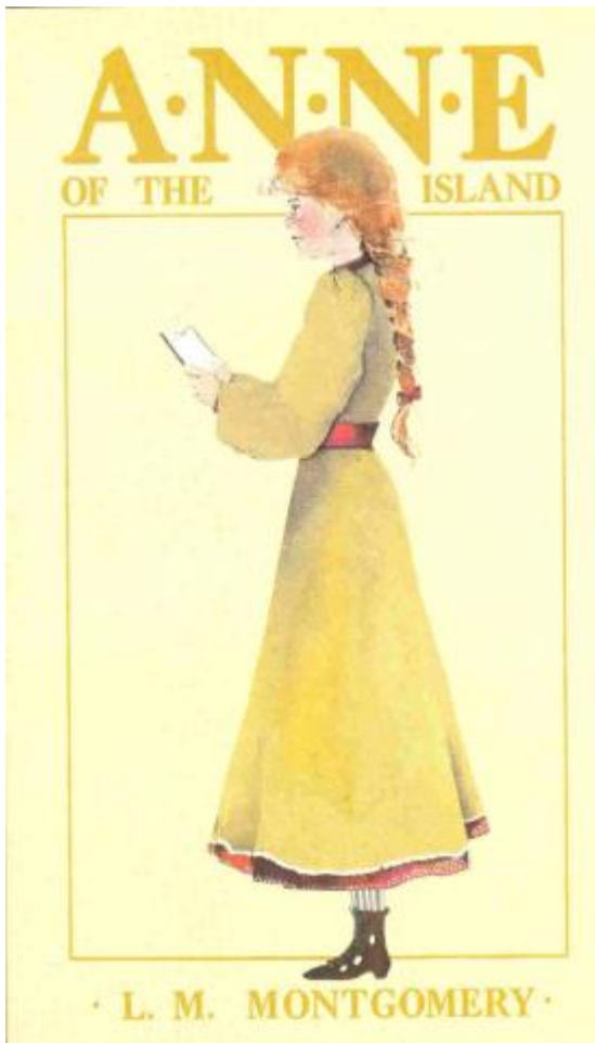
Book cover of Anne of the Island. 1968.

However, since Anne as an individual takes her writing the furthest of the Avonlea crowd, she provides perhaps the best example of the reader-creator transition in the Anne books. I'm particularly fond of the scene in Anne of Avonlea in which Anne is stuck armpit-deep in a duckhouse, having stood on the roof to peek in a window and fallen through. 13 She contrasts her state to those of heroines' she's read, whose "misfortunes" are "romantic," as opposed to her "simply ridiculous" ones. 14 Shortly thereafter, while still stuck in the duckhouse, Anne imagines a "most interesting" idea for a story that she feels the need to record immediately, "because I daresay I'll forget the best parts before I get home." 15 And so she "wrote out her garden idyl under conditions that could hardly be considered as favorable to literature," that is, while encased in a half-collapsed bird coop. 16 Here, Anne demonstrates a serious devotion to writing. But she also exemplifies an irresistible writerly impulse in a readerly heroine, a way of story-izing life whereby avid readers create a lens to view