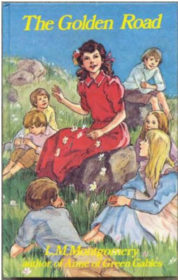
Book cover of The Golden Road . 1982. KindredSpaces.ca , 010 GR-AR.

Some believe that reading is a passive endeavour: a reader absorbs the thoughts of the author while sitting in a stationary environment. But those of us who read avidly, like Montgomery's heroines do, know that reading is a much more active endeavour than it appears. We engage our minds, emotions, thoughts, and imaginations when we read. We may discuss what we read: with family, with friends, with our book groups (either online or in person), with colleagues, with classmates, with teachers/professors, with students, with Bookstagrammers. 5 In addition to discussing what we read, many readers are prompted to take action—social, political, scholarly—based on what they read. In these cases, reading is, by definition, an activity. Readers, rather than being passive recipients of the texts they read, are active interactors and engagers with the textual material and, by extension, with a world of book discussion and interaction outside the text.