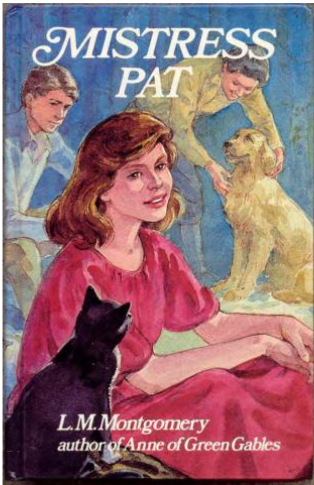
Book cover of Mistress Pat . 1982. KindredSpaces.ca . 017 MP-AR.