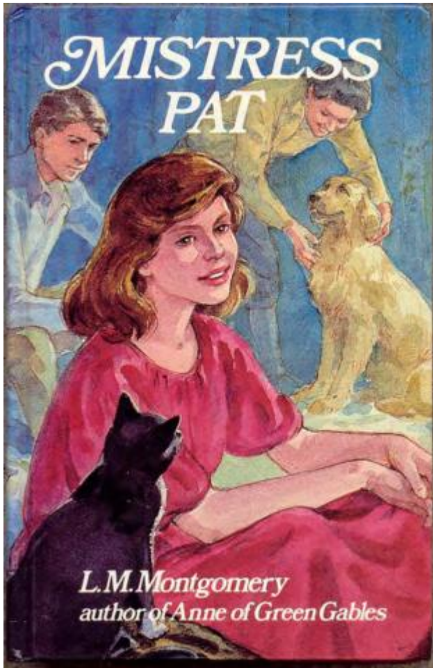
Book cover of Mistress Pat. 1982.